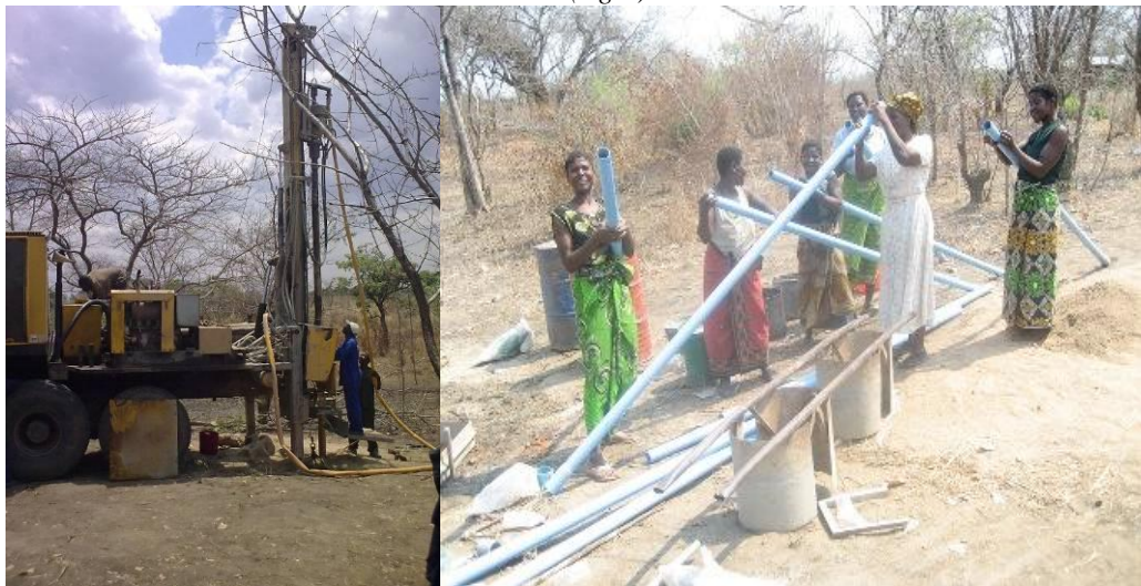
The drilling truck (with compressor) at work (left); women helping with the pipes during the construction of the Secondary School borehole(right). The compressor dug about 50 meters into the ground