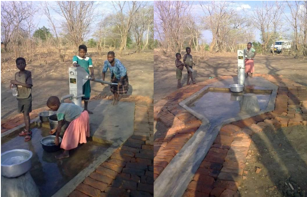
The Secondary School Borehole: Kids from the surrounding community enjoying fresh and clean water from the borehole

Kasupe Ministries is pleased to inform you that we have constructed two boreholes (deep water wells) in the village. The boreholes, funded by Europe Third World Association & Ashland Presbyterian Church, are located at Kasupe Kindergarten and Secondary School respectively. We have spent about $7000 on each borehole. We praise God because part of the Kasupe community of about 4000 people will have access to clean water at least for the next 15 years. Below are some pictures of the boreholes.