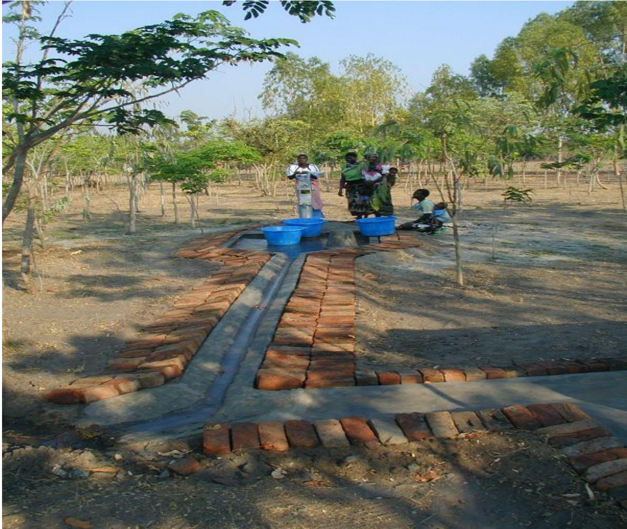
The borehole at the Kindergarten means a lot to these women because their kids will no more suffer from water-borne diseases