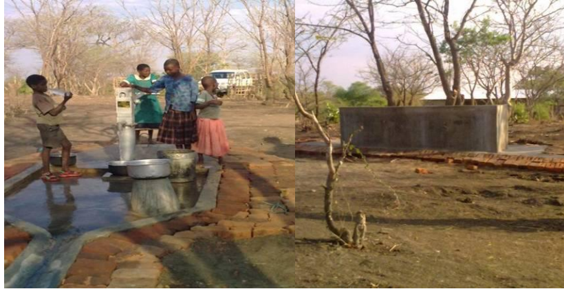
These kids will use this borehole for the next 15 years (left); a washing slab near the borehole (right)