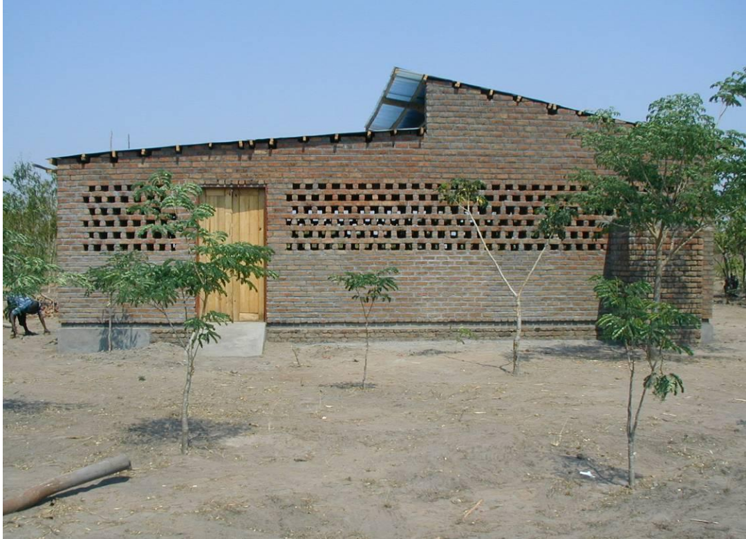
The HIV/AIDS Counseling House